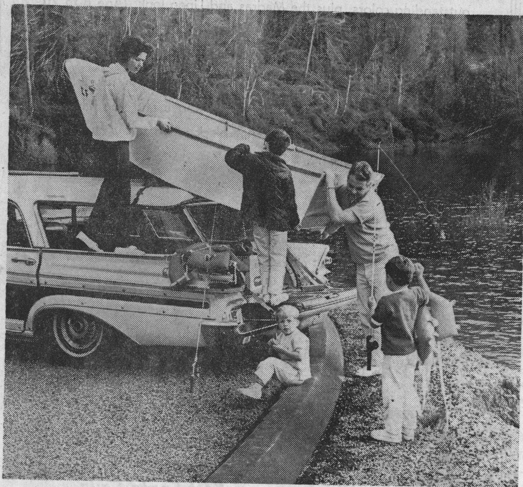
With modern lightweight materials, unloading a cartop boat is a cinch. Well, almost a cinch, even when only one of the boys is giving more than moral support. The flotation vests on the car fender are required equipment for boaters at the lake.