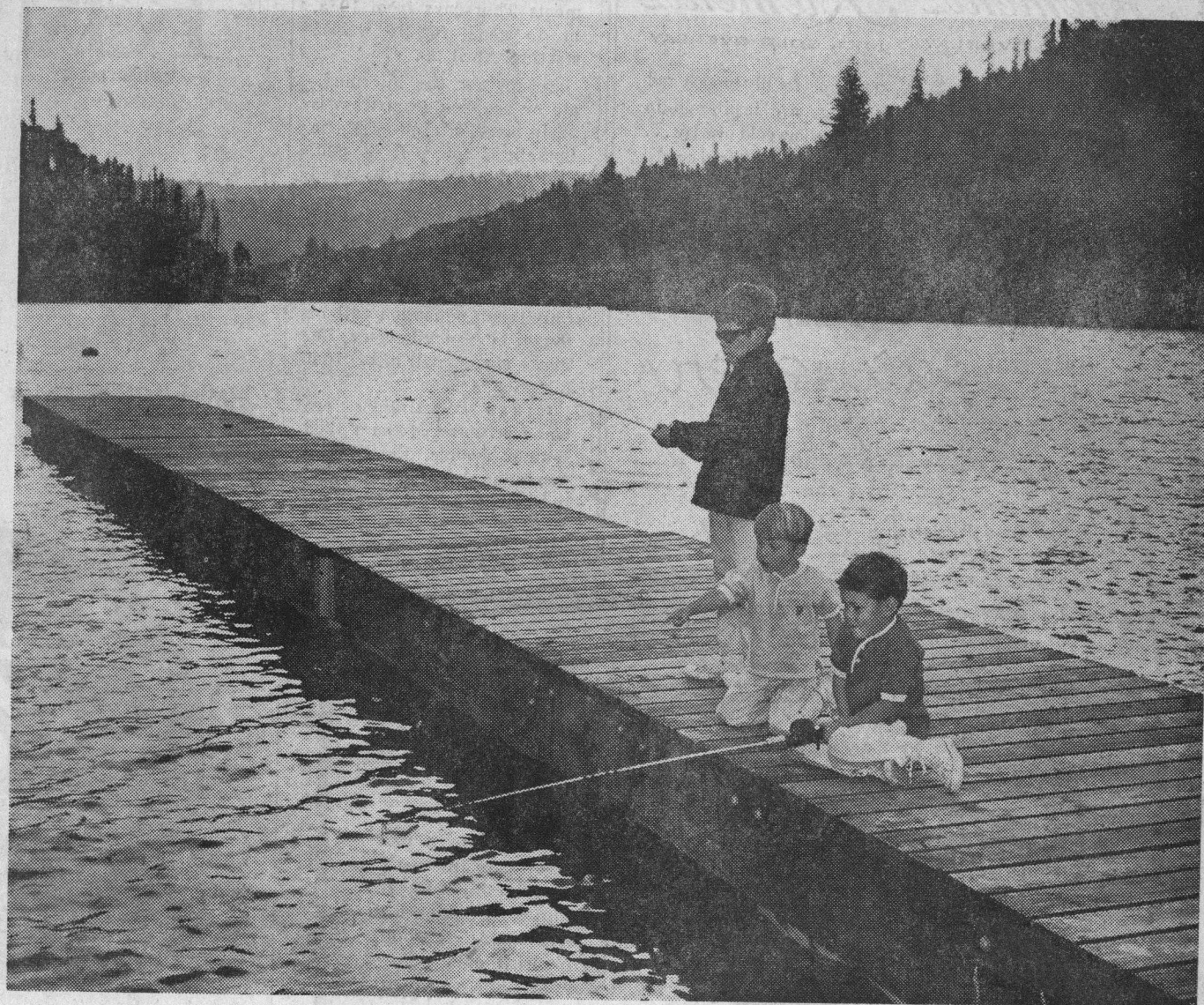
Judging by the bend of the poles, the boys aren't catching anything. Nonetheless, the lake has been stocked with rainbow trout—fingerlings and 20,000 catchable fish. An additional 100,000 catchables will be stocked during the season. Stocking started two years ago.

The thinned-out appearance of the timber on the slopes results from a forest fire in the area when work on Newell Creek dam started. The forest is recovering, but plenty of fire-killed timber is still standing to provide firewood for the picnic areas.