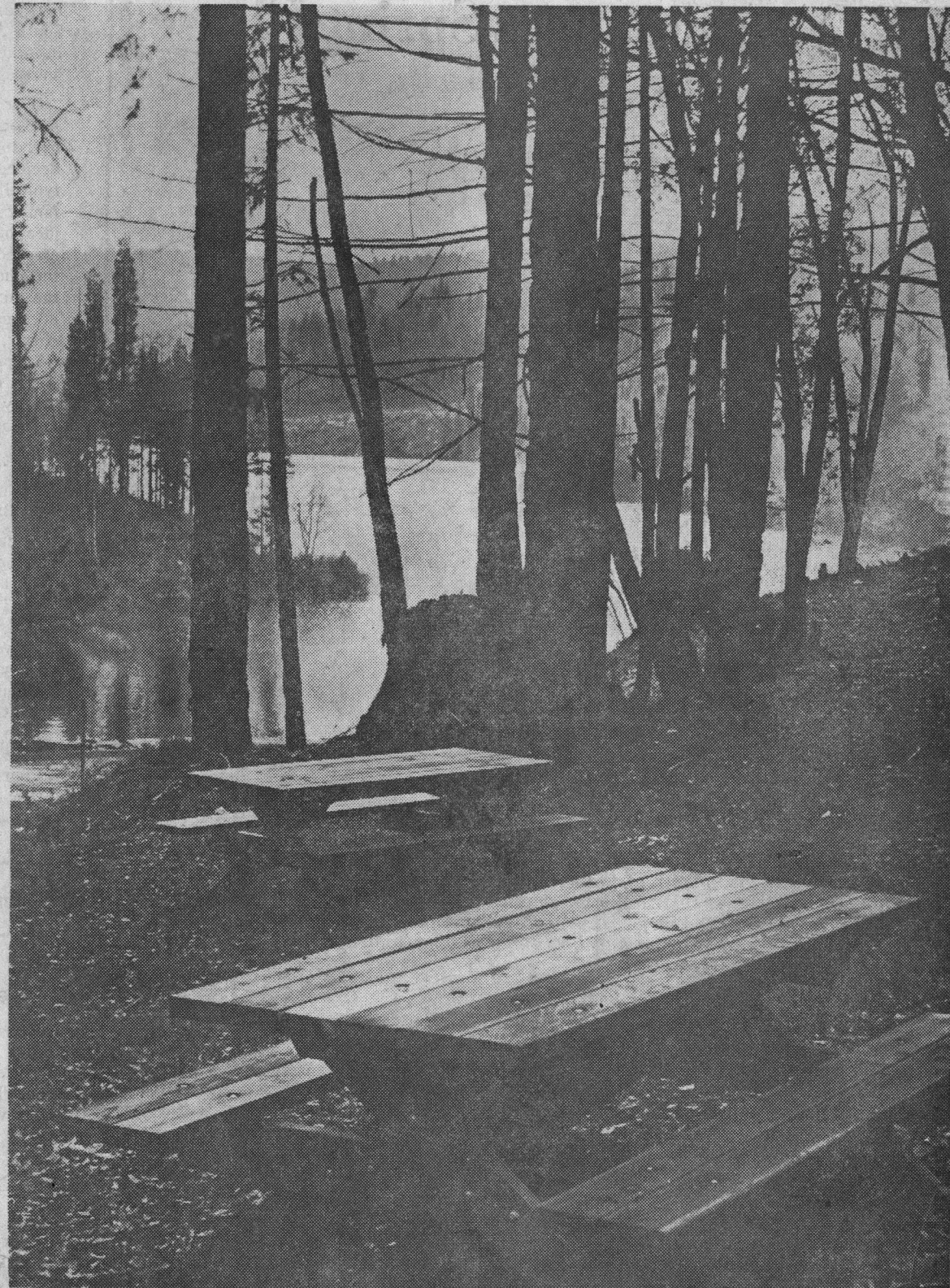
Trees behind this picnic area frame the lake below. The boat launching area is almost directly below this site.