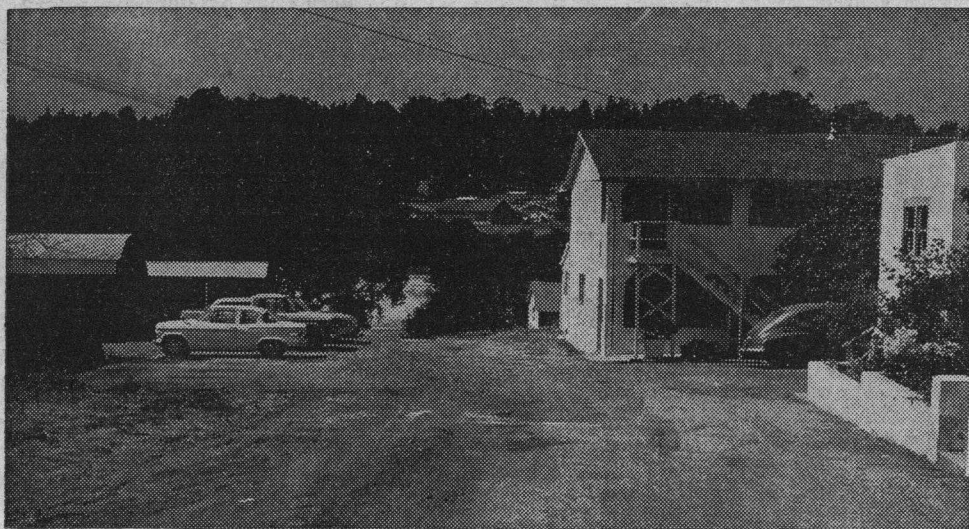
Does This Look Like an Entrance to a $400,000.00 High School?

The Original Plans called for 50 Acres of Usable Ground. If the Road is Put Through Only 20 Acres Will be Available for Educational Purposes. There Will Not Be Enough Room for Expansion or Athletic Facilities. The Site is Too Expensive in Dollars and Too Noisy for Educational Purposes.