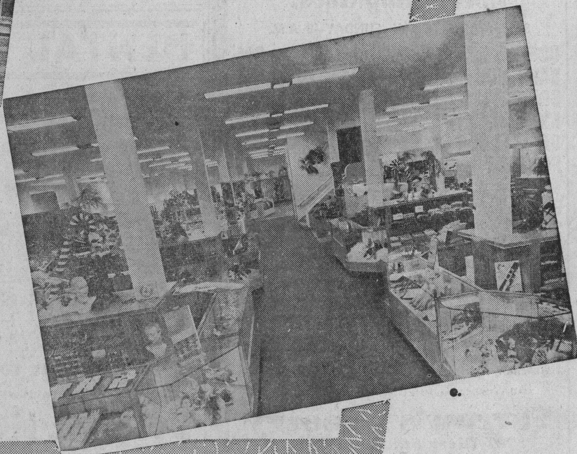
e. Main floor of Leask's as it looks today . . . 1957.