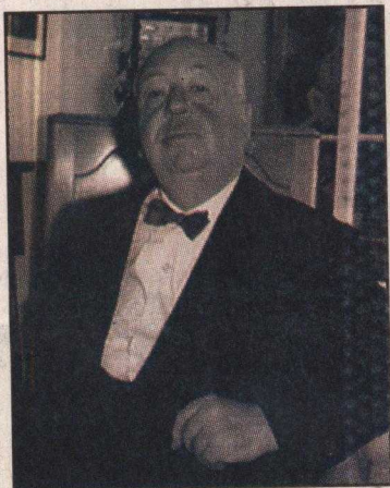
The fabled director strikes a jovial pose at home in Scotts Valley.