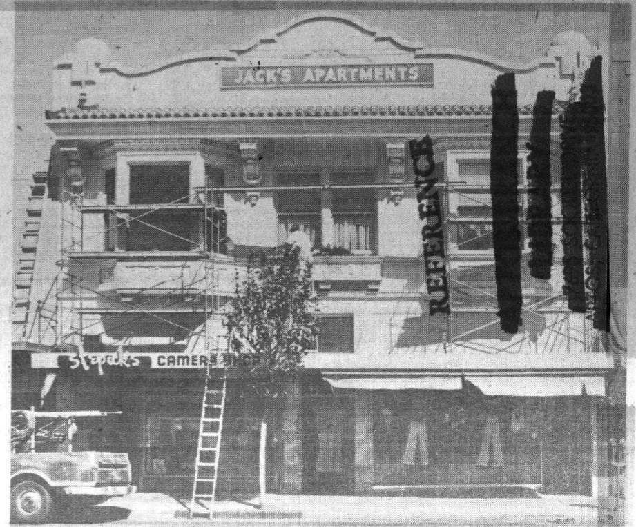
Jack's Apartments is getting a new coat of paint