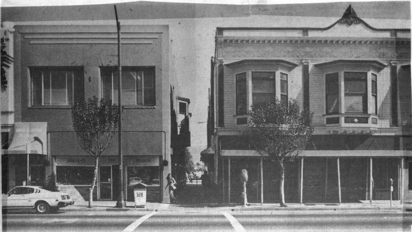
Chamber building, left, and Taylor's Office Supply: Exasperation over graffiti caused one wall of alleyway to be left unpainted