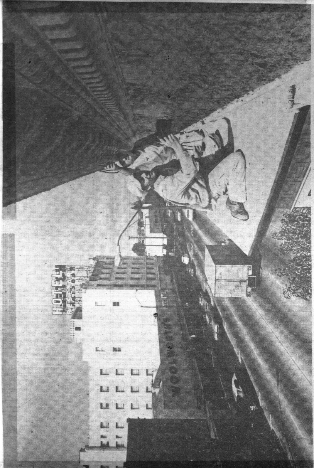
The central business district is seeing a spate of clean-up activity. Story and pictures page 9.