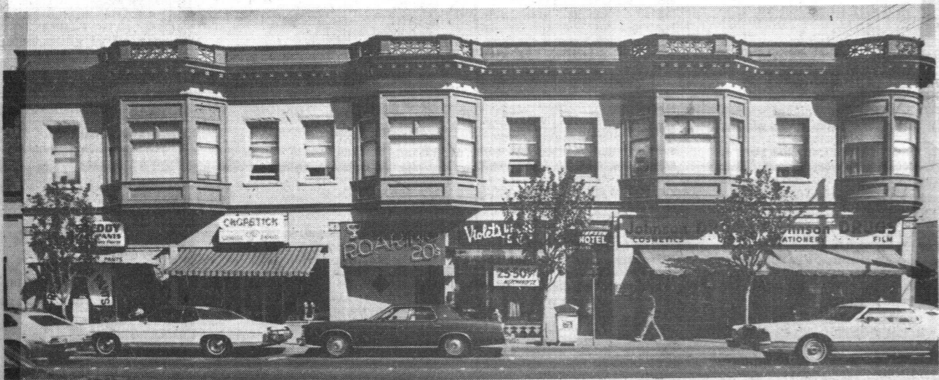
Second-story paint job gave Jefsen Building new life