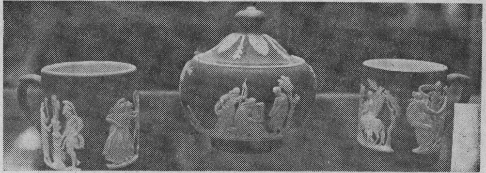
CHILD'S TEA SET PIECES

Delicately wrought pieces of Wedgwood ware are on display at the Santa Cruz Public Library through May 3, and it isn't necessary to be a china buff to appreciate the detail and workmanship which goes into the making of the ware.