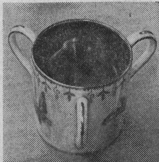
... LOVING CUP

The modern Wedgwood factory, located in North Staffordshire, is visited annually by some 40,000 people.