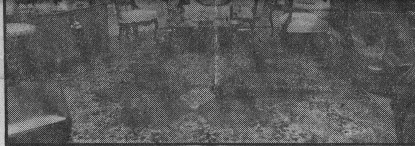
The living room in the Queen Anne home is furnished with Tia Baldwin's antique pieces of the same era. Below, a dragon lives in the McCloud-McCracken house — but it's just another of their carousel animals.

Some 25 dealers from all over the state will present a variety of wares at the show-sale.