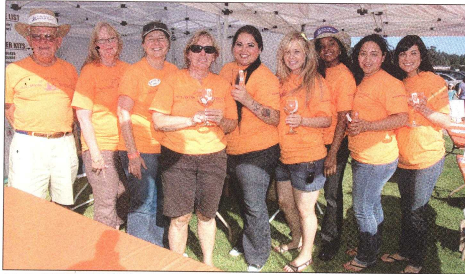
Join the VOLUNTEER TEAM!

It's a Great Day in Skypark at the Scotts Valley Art & Wine Festival, August 11 and 12. If you would like to join the Volunteer Team, applications are still being accepted. For more information, call the Scotts Valley Chamber of Commerce at 831-438-1010 or visit www.scottsvallychamber.com .