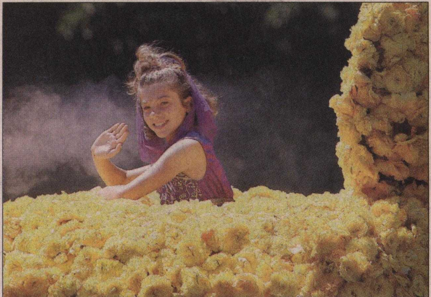
A girl dressed as a genie waves to the crowd as she floats down Soquel Creek near Capitola Village on Sunday afternoon during the annual Begonia Festival Nautical Parade.