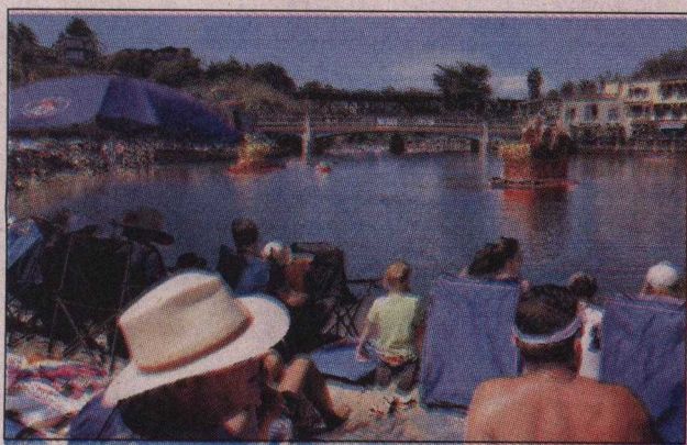
Hundreds gather around Soquel Creek in Capitola on Sunday to watch the Begonia Festival Nautical Parade.