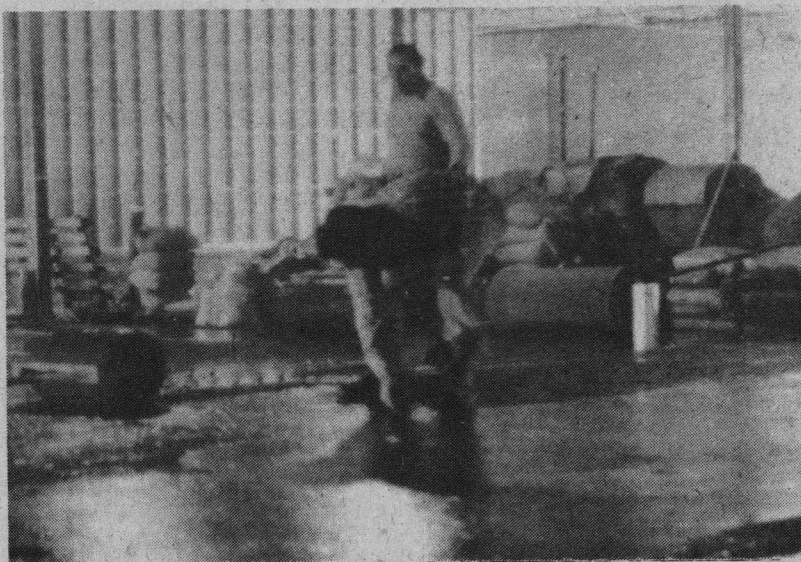
INSIDE FLOORS — The concrete slab floors have been completed for several of Capitola Mall's stores, but many more are still needed to be done to meet the April 14 grand opening date. Photos by Keith Muraoka.