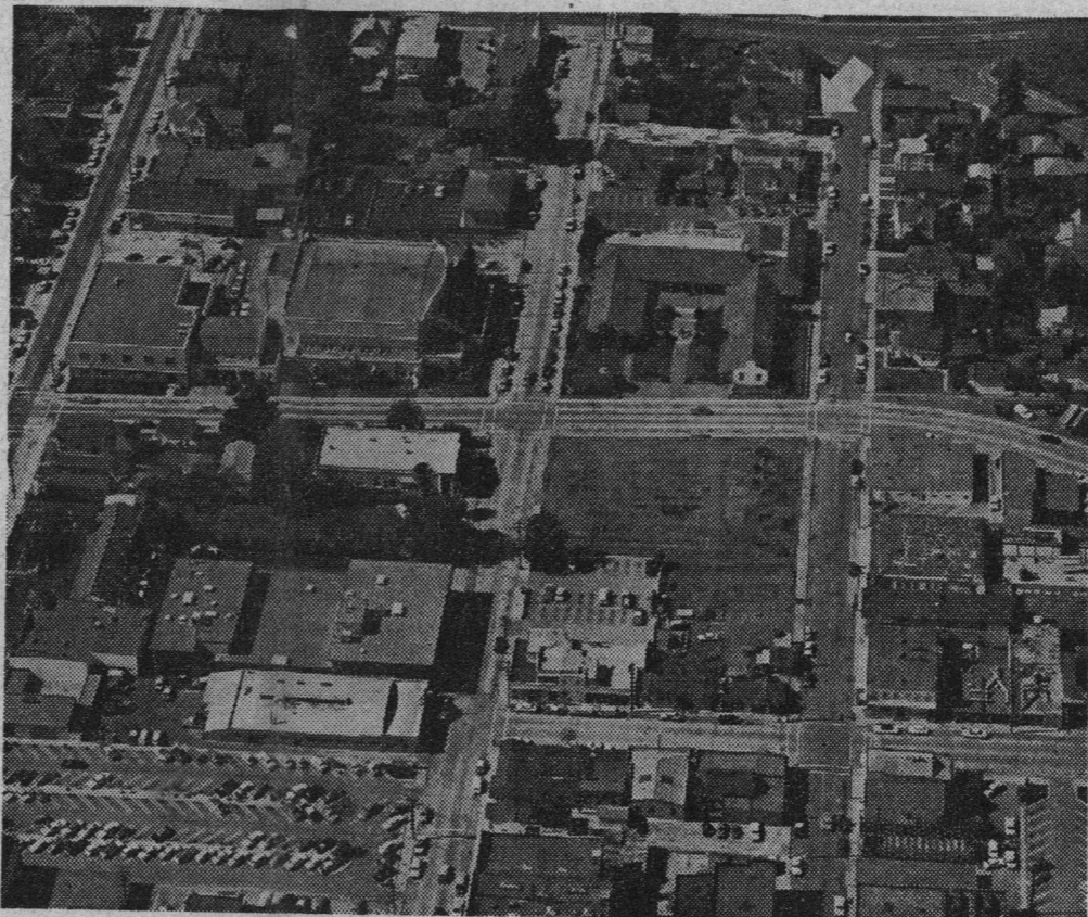
The area behind the Santa Cruz city hall building within the white line drawn on this picture (see arrows) indicates where the two-story of the civic center, across Center street, is the land where the new main library

Santa Cruz Mayor Eugene Fleming said today: "I feel the voters made a wise choice in deciding to proceed with this work when they did and I can assure you that the city council and city staff is doing everything in their power to complete these jobs as quickly, economically and efficiently as is