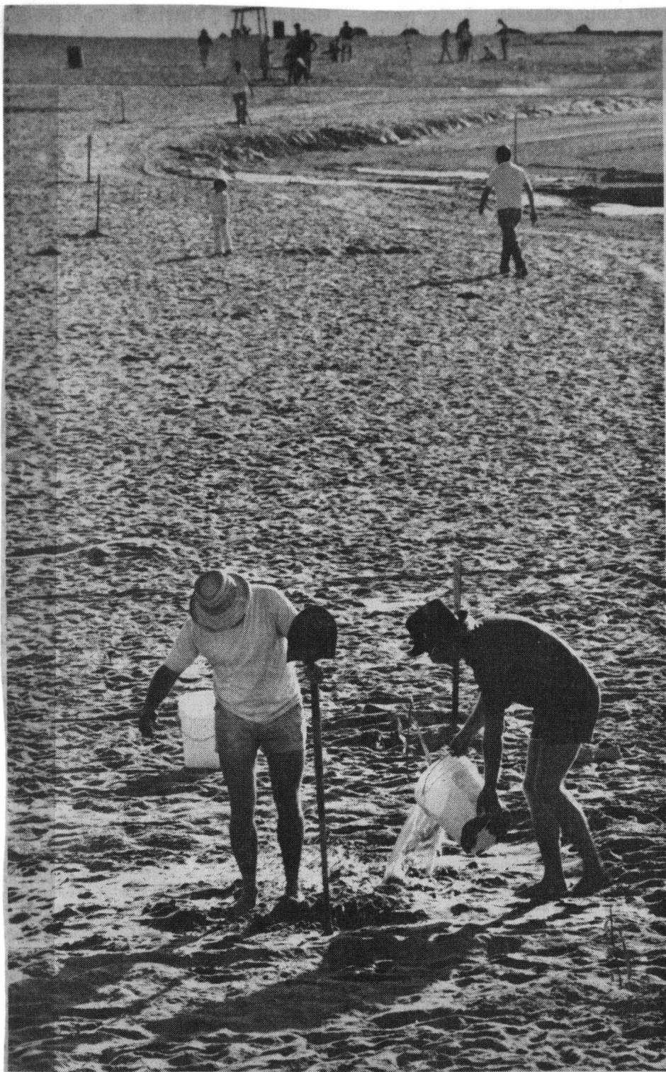
The beach was quiet at 10:30 a.m. ...