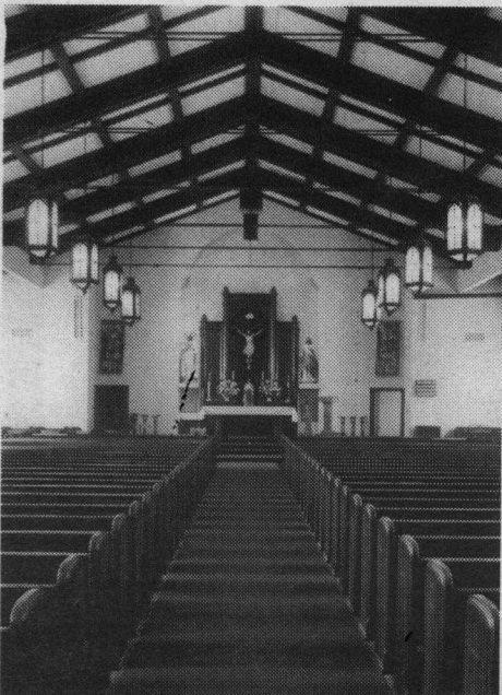
SANTA CRUZ — Interior of Star of the Sea Church is devotional yet well-suited to today's liturgy.