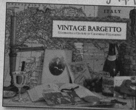
BARGETTO WINERY 'Vintage Bargetto' chronicles the family's history in words and pictures.