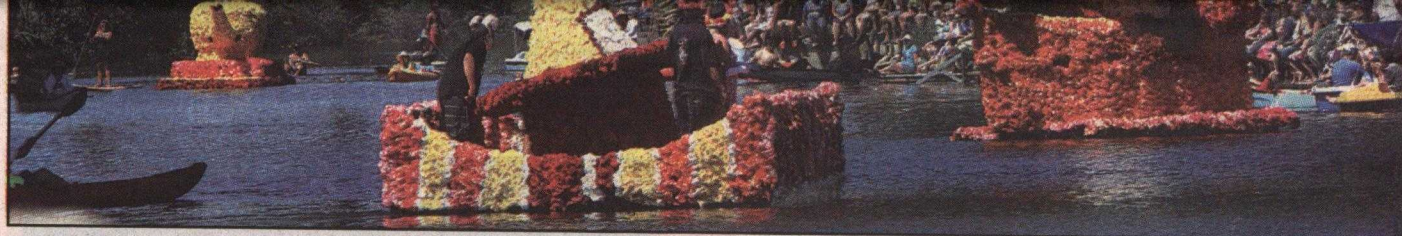
Thousands of people flocked to the festival, especially on Sunday to see the Nautical Parade.