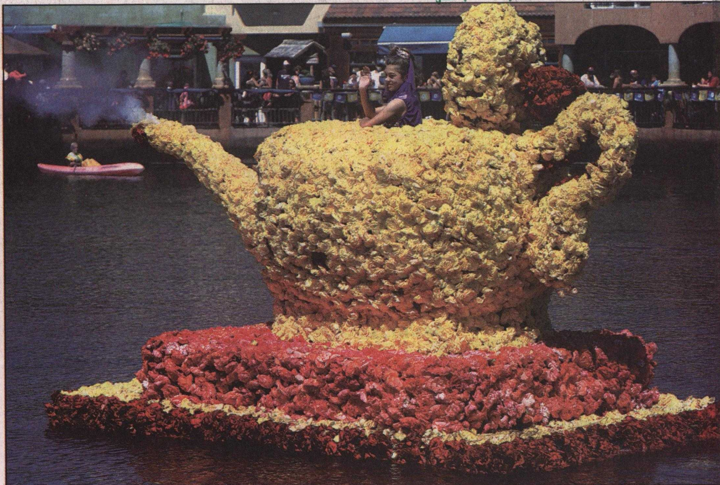
Aladdin's Lamp/Genie in a Bottle by the Riverview Rascals placed second.

Visitors at the free event also enjoyed horseshoes on the