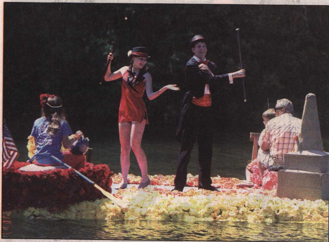
Capitola Magic was this year's Nautical Parade theme.