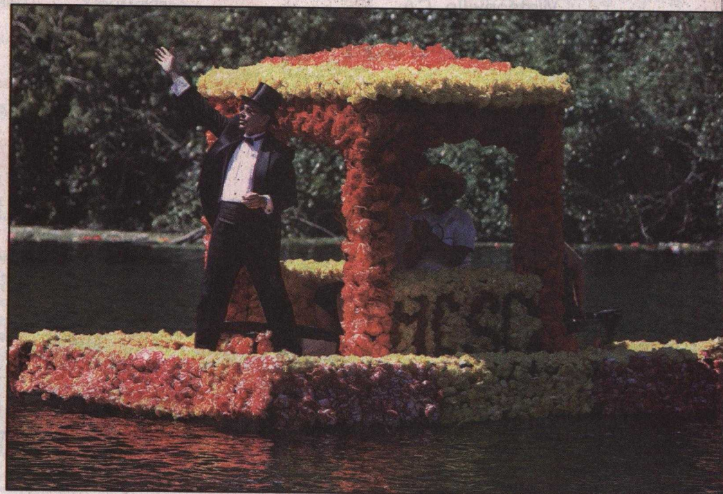
A Magic Place, created by Mid County Senior Center, came in fourth.