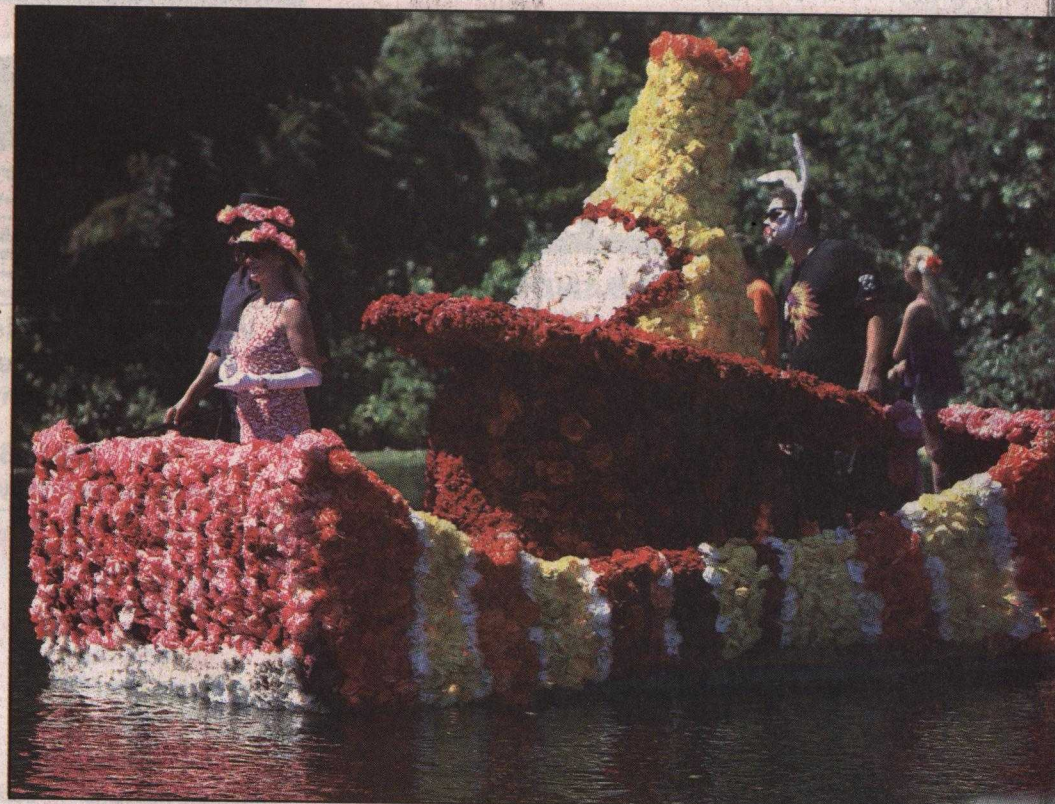
Magic Fun With Bubbles by It's Wine Tyme earned best showmanship.