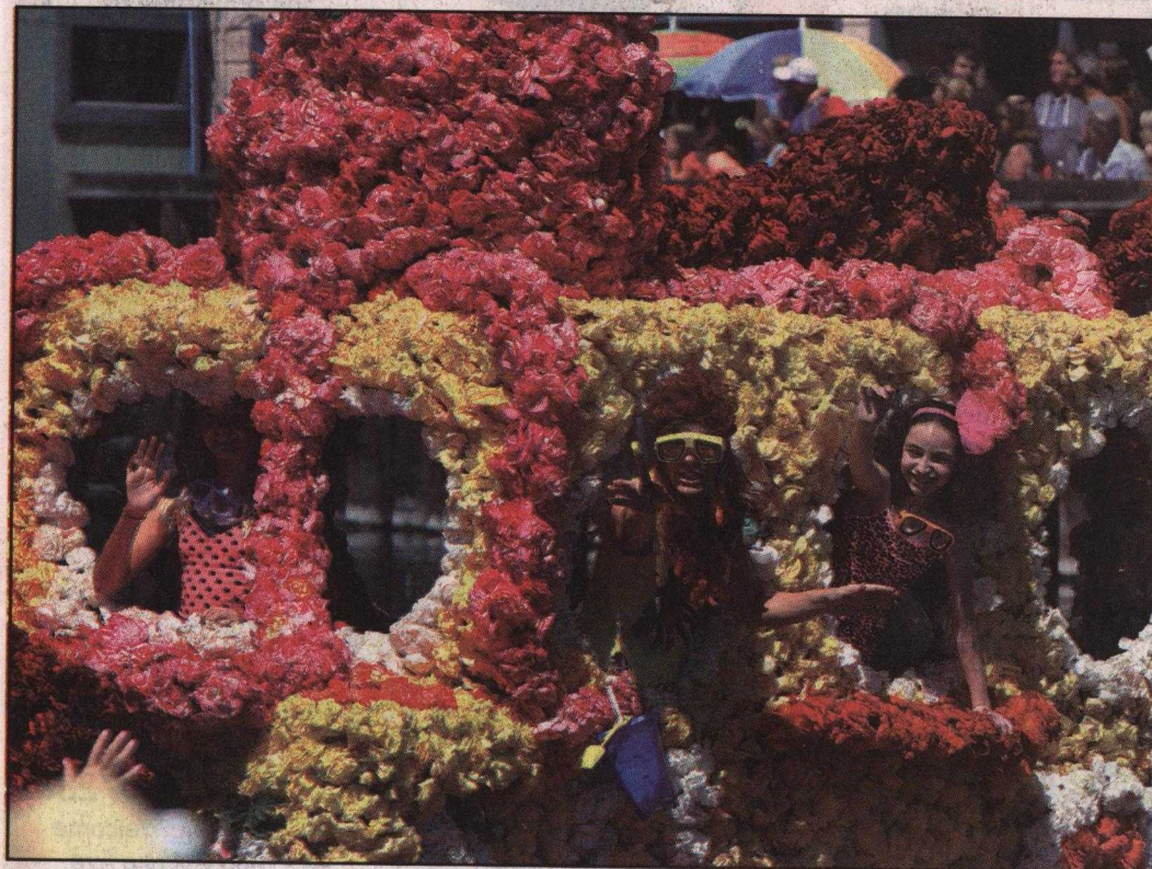
The Magic School Bus, by Friends of the Windmill House, placed third.