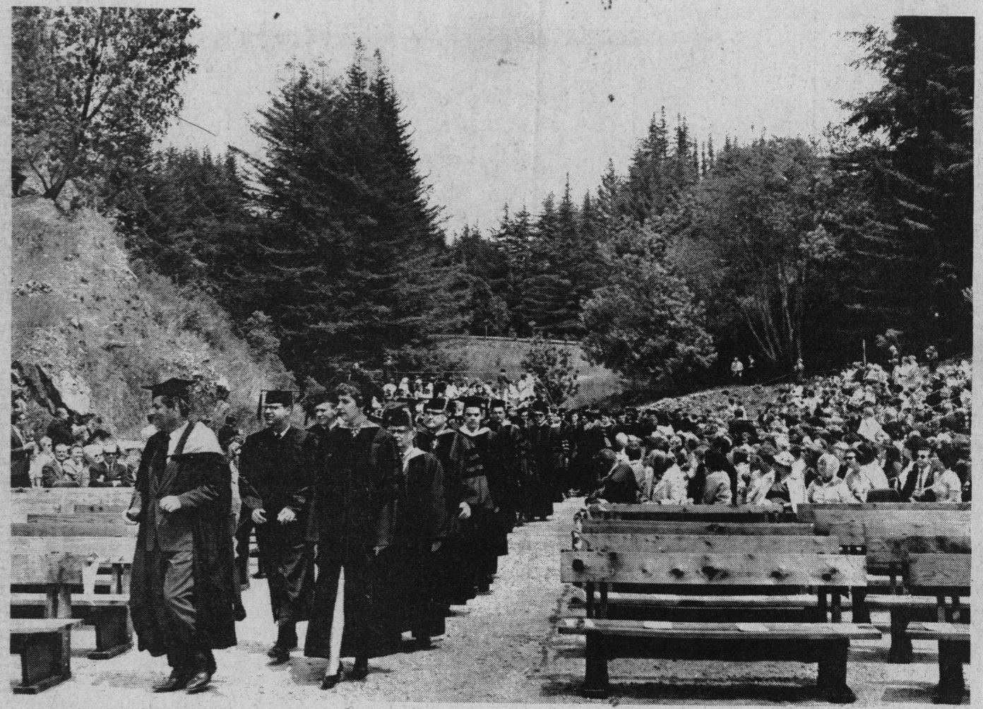
ENTRY OF CANDIDATES -- To the accompaniment of "Pomp and Circumstance" marched the first graduates of UCSC, with the academic procession, all decked out in a colorful display of academic dress, ranging from Harvard's