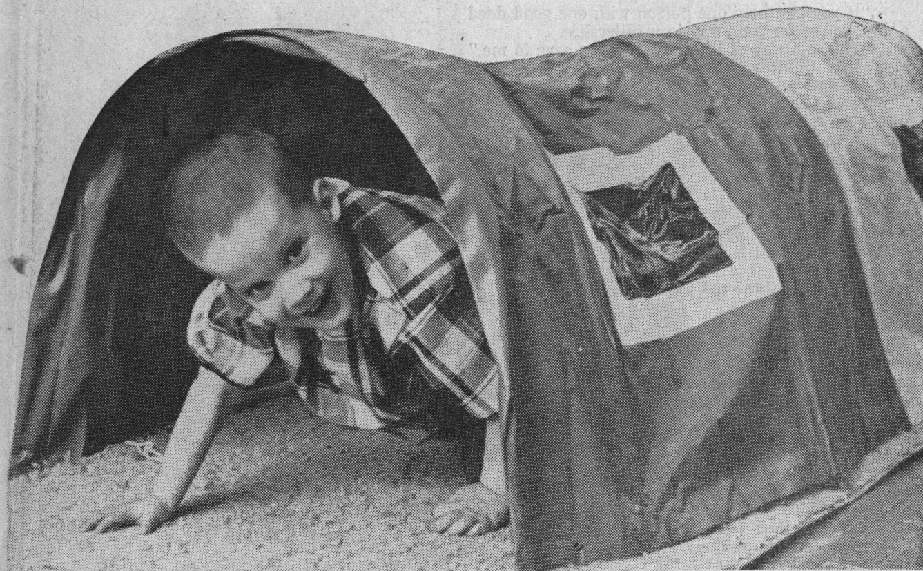
... Crawls through a tunnel, a pastime all young boys find fascinating.