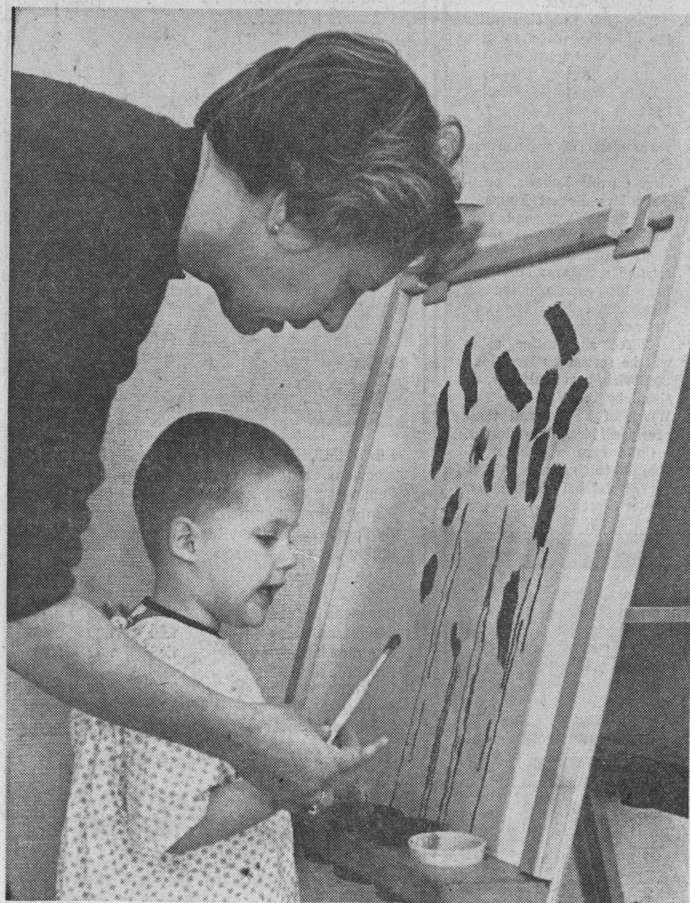
... Paints a pretty picture.