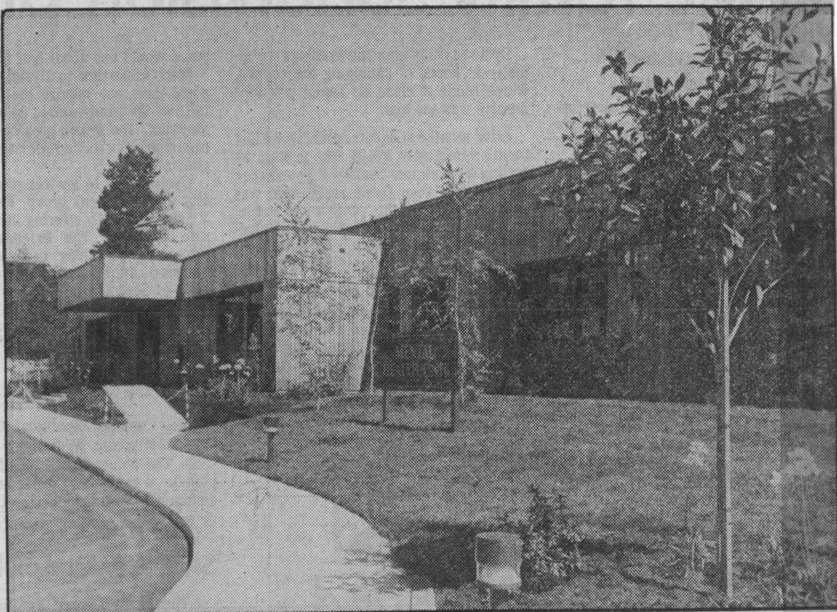
The face of Dominican's new Mental Health Unit

Bishop Thaddeus Shubsda of the Monterey Diocese performed the dedication ceremony, which was followed by tours of the building.