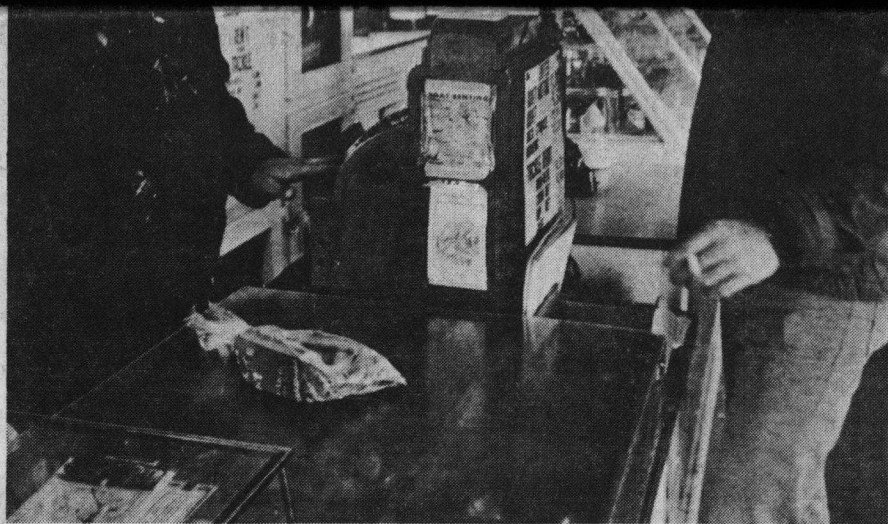
Stocking up in the bait shop.