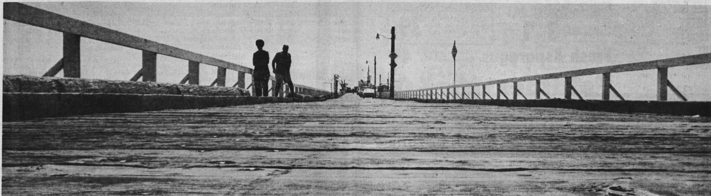
There's no better place for a walk than the wharf on a brisk, windy day.

Whatever happens, it is a great place for pictures.