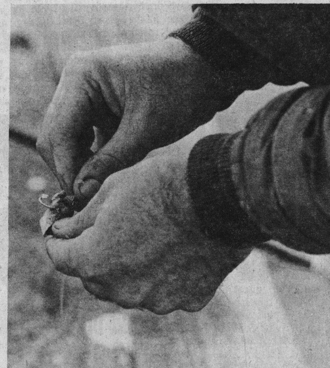
Baiting the hook.