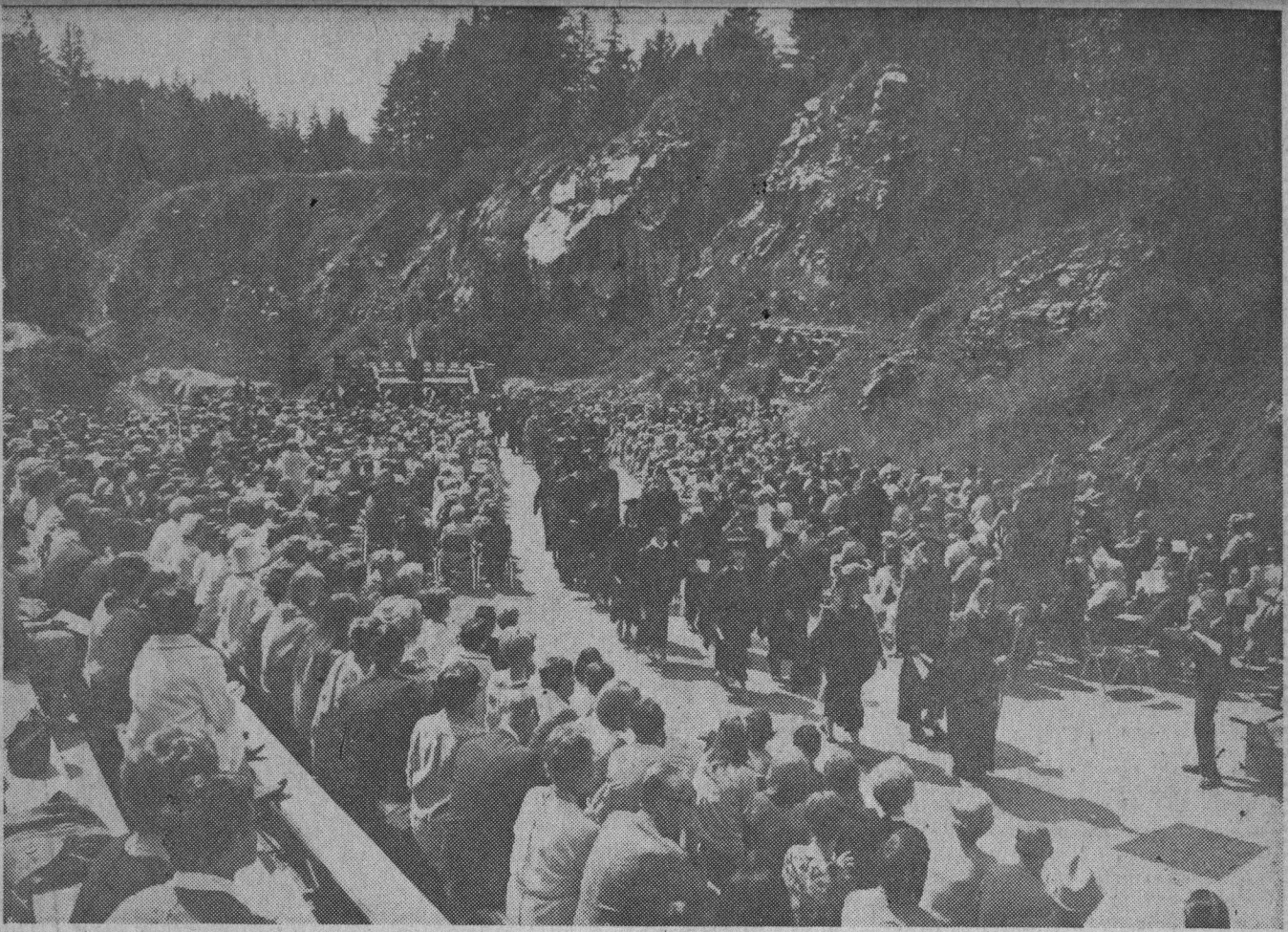
Preceded by the newly-designed banner, graduates of Stevenson College march from the upper quarry at the conclusion of yesterday's first commencement exercises at the University of California, Santa Cruz. Some 1000 persons attended the ceremonies during which 20 Stevenson students

He appealed for aid in finding those "future leaders who are mature enough for the social freedom and the academic honors program offered here," and for help in "recruiting students with underprivileged backgrounds and in supporting them while here."