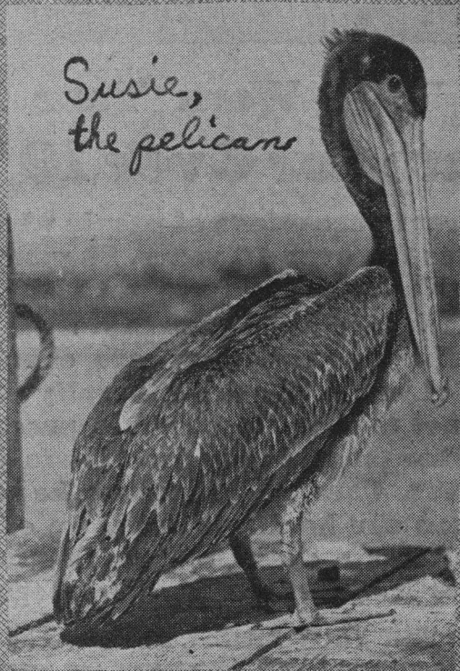
Susie, the pelican