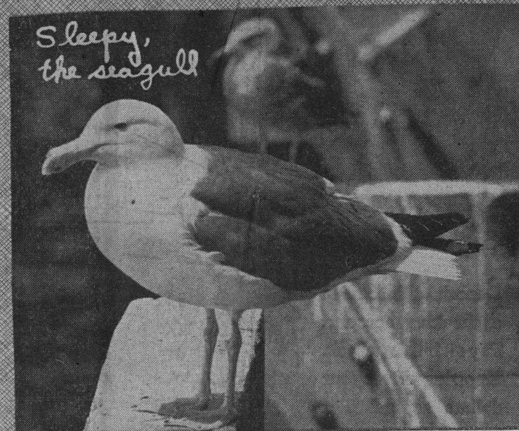
Sleepy, the seagull