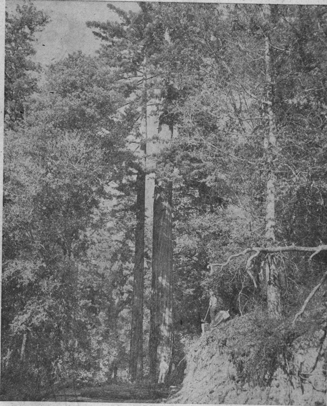
Given by Santa Cruz county as a perpetual monument to the Los Angeles County Fair association