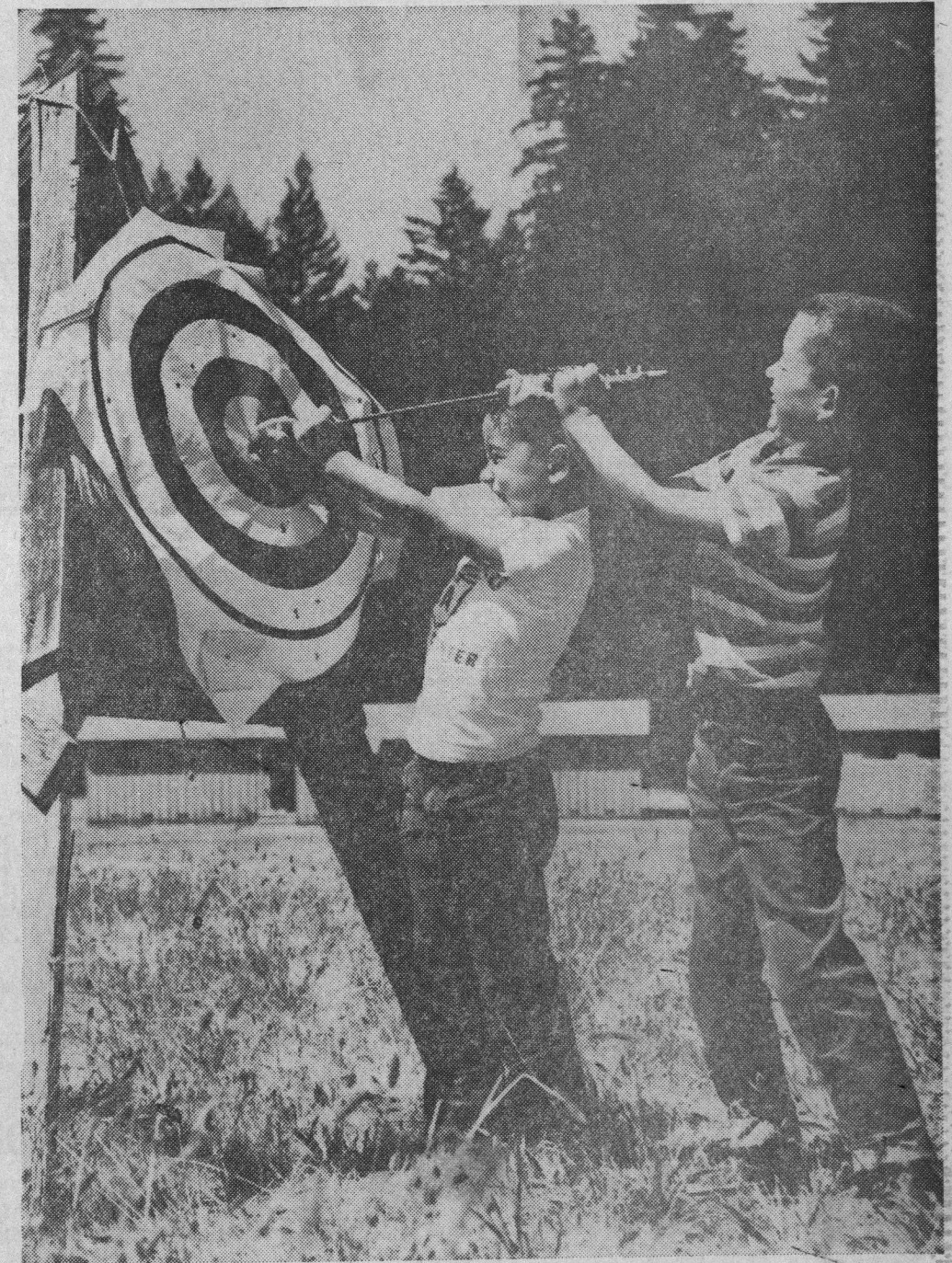
Bullseye! Archery is just one of the many sports taught to Redwood Glen campers by the trained staff of over 40. The teaching of sports is a way of helping the children learn the values of sportsmanship.