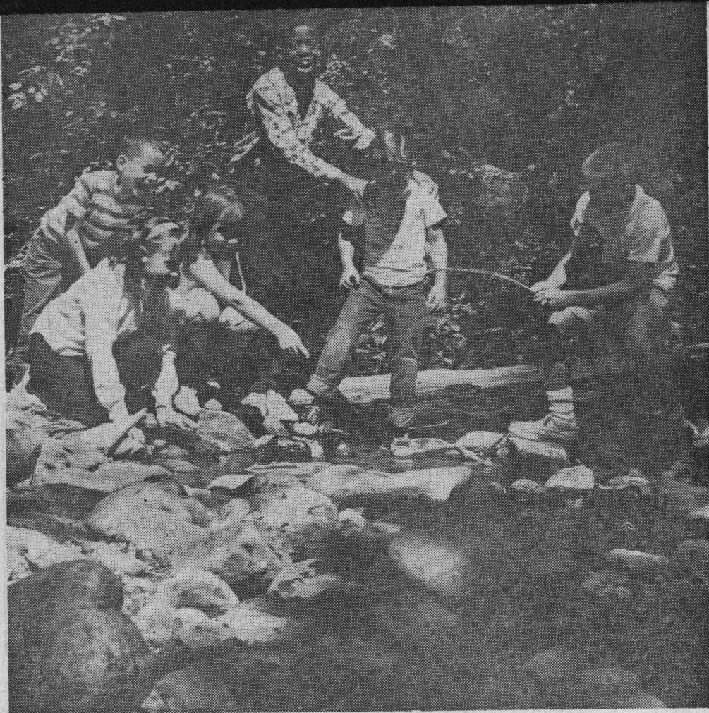
Youngsters attending the camp have a chance to explore the mountain streams, go fishing and just have fun. The camp provides them with 240 acres to hike over and live in for their week at camp.