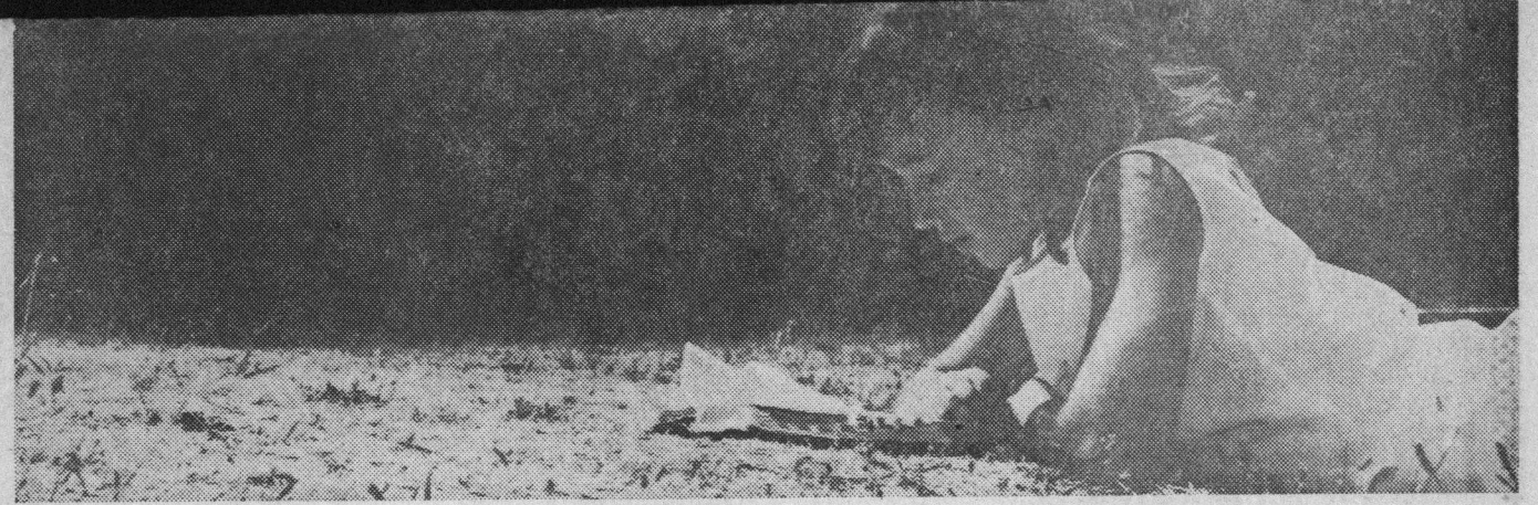
This is just one of the chapels on the grounds of Redwood Glen camp. The other is a natural chapel where the Redwoods form the roof and altar.

Redwood Glen is one of two such Salvation Army camps in California. Camp Mountain Crags in the Malibu Hills serves Southern California. Both camps are