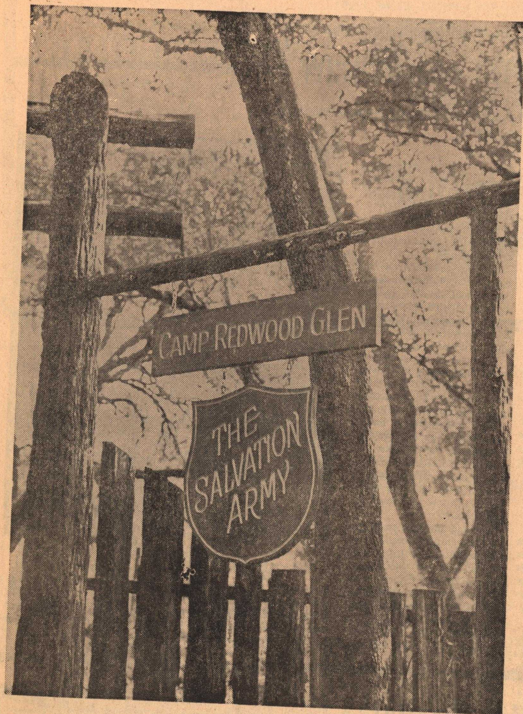
Camp Redwood Glen, located at 3100 Bean Creek road, is the 240-acre camp operated by the Salvation Army. Last year more than 1900 boys and girls from Northern California entered this gate. Over half the youngsters attended on camperships donated by individuals and organizations.