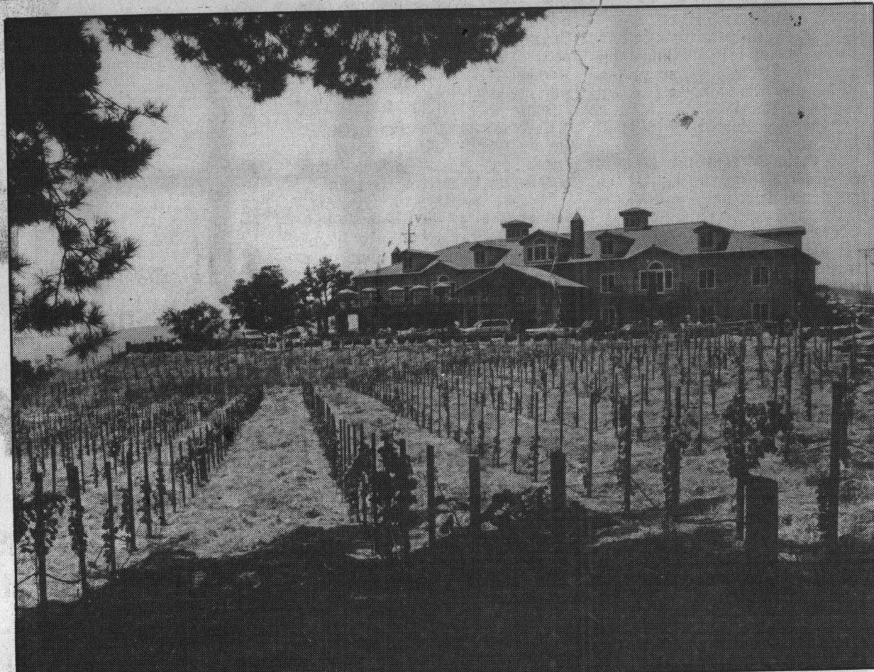
The Byington Winery in Boulder Creek features a 17,000-square-foot chateau.