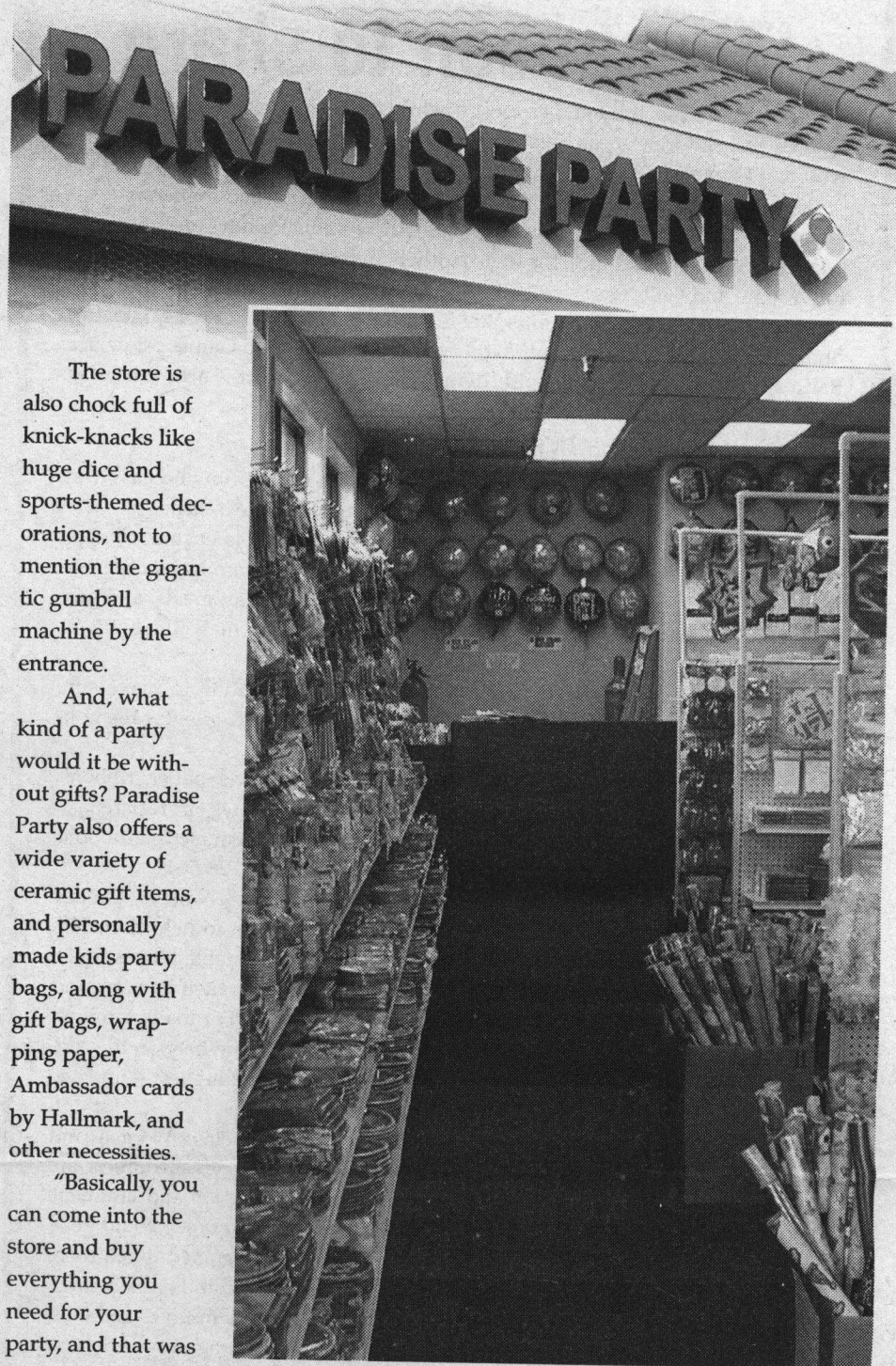
The store is well-stocked, organized and orderly.

For partiers looking for a tropical island celebration, Paradise Party also offers a full Tiki party theme for luaus.