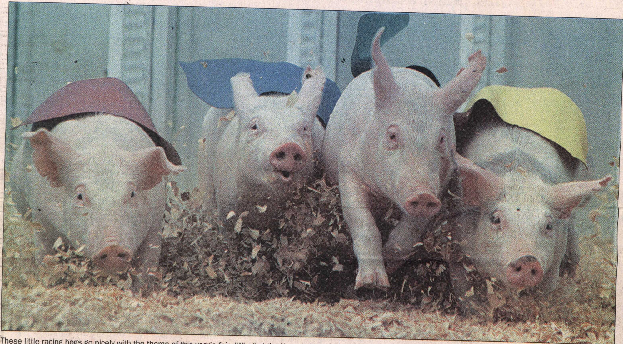
These little racing hogs go nicely with the theme of this year's fair, 'Who Let the Hogs Out?'