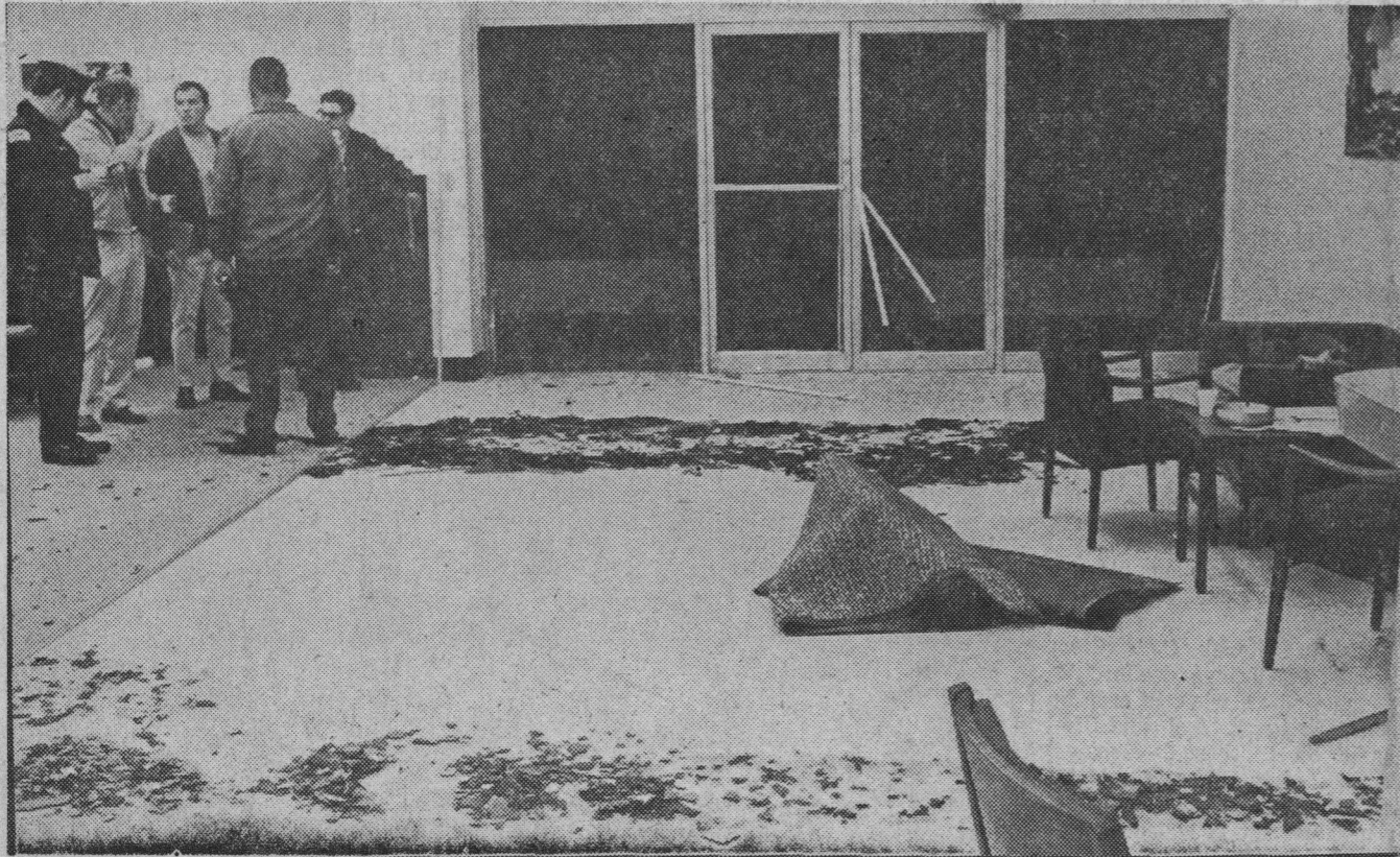
At left, the interior of the West Santa Cruz Branch of Bank of America, 1640 Mission St., is littered with debris following the explosion of a cast iron pipe bomb Saturday at 1:14 a.m. No one was injured. Damages were estimated at $10,000.