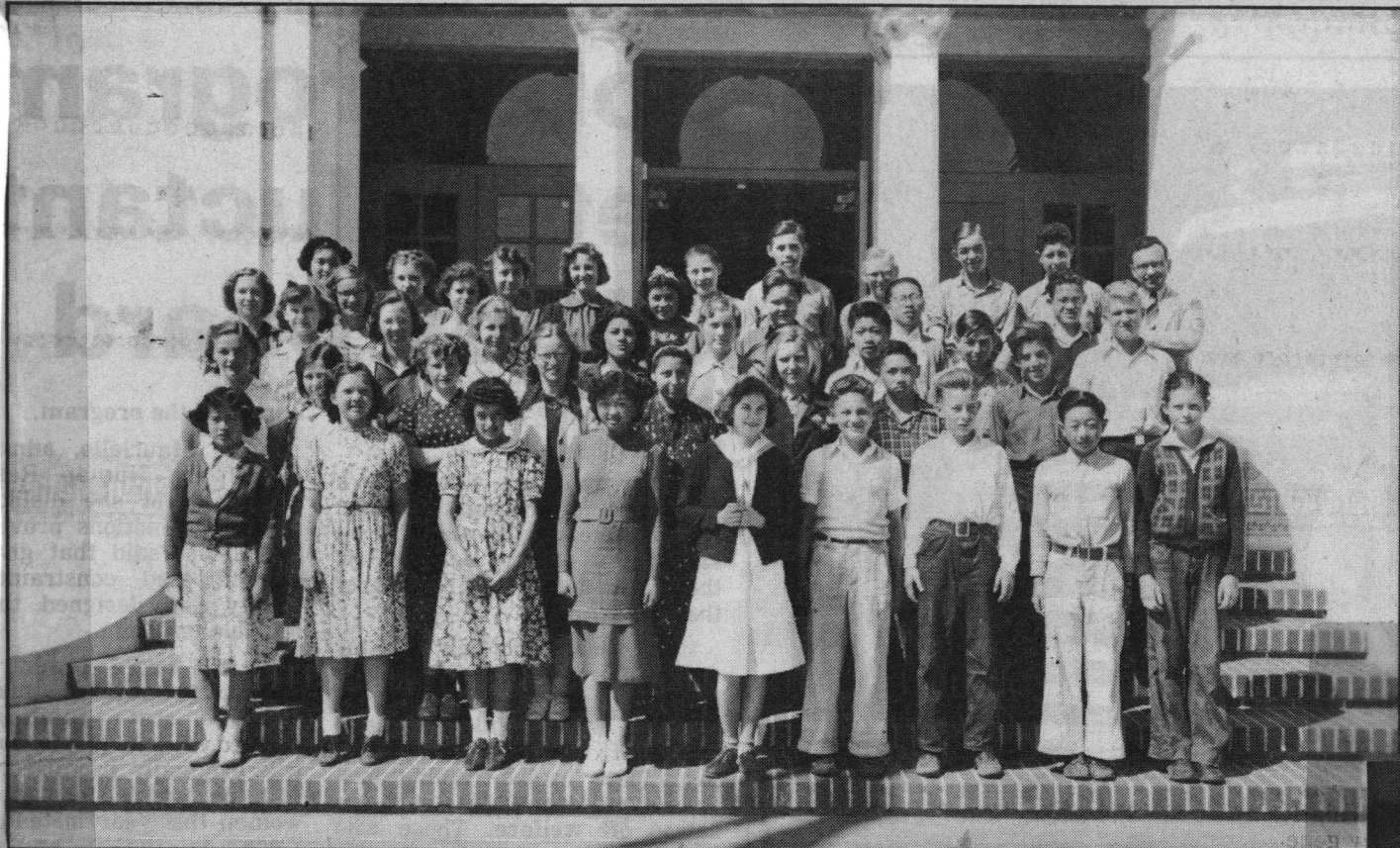
Part of the first graduating class of school poses on front steps.