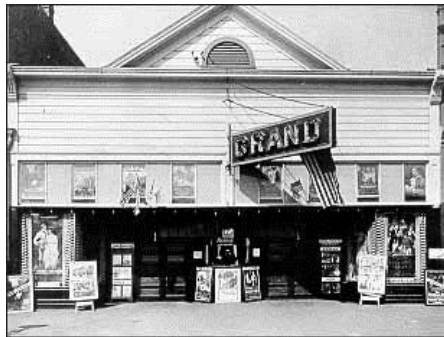
The Grand Theatre

The Grand Theatre, one of the first movie theaters in Santa Cruz, was on Pacific Avenue, across the street from Walnut. These photographs were probably taken around 1915. The posters in front of the theater advertise The Eternal City (1915), Marriage à la Carte (1915 & 1916), and a film featuring Eddie Plum and Lee Moran. Plum and Moran were together in film called, Mrs. Plum's Pudding in 1915.