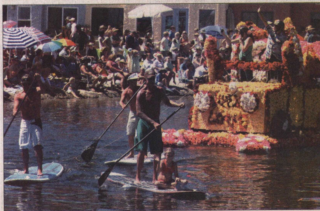
ABOVE. "High Tech Safari," a begonia-covered float by the Riverview Rascals, earned first place Sunday in the nautical parade during the Capitola Begonia Festival.