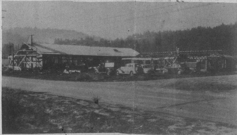
Construction of St. John's Catholic Church began in September of 1951.