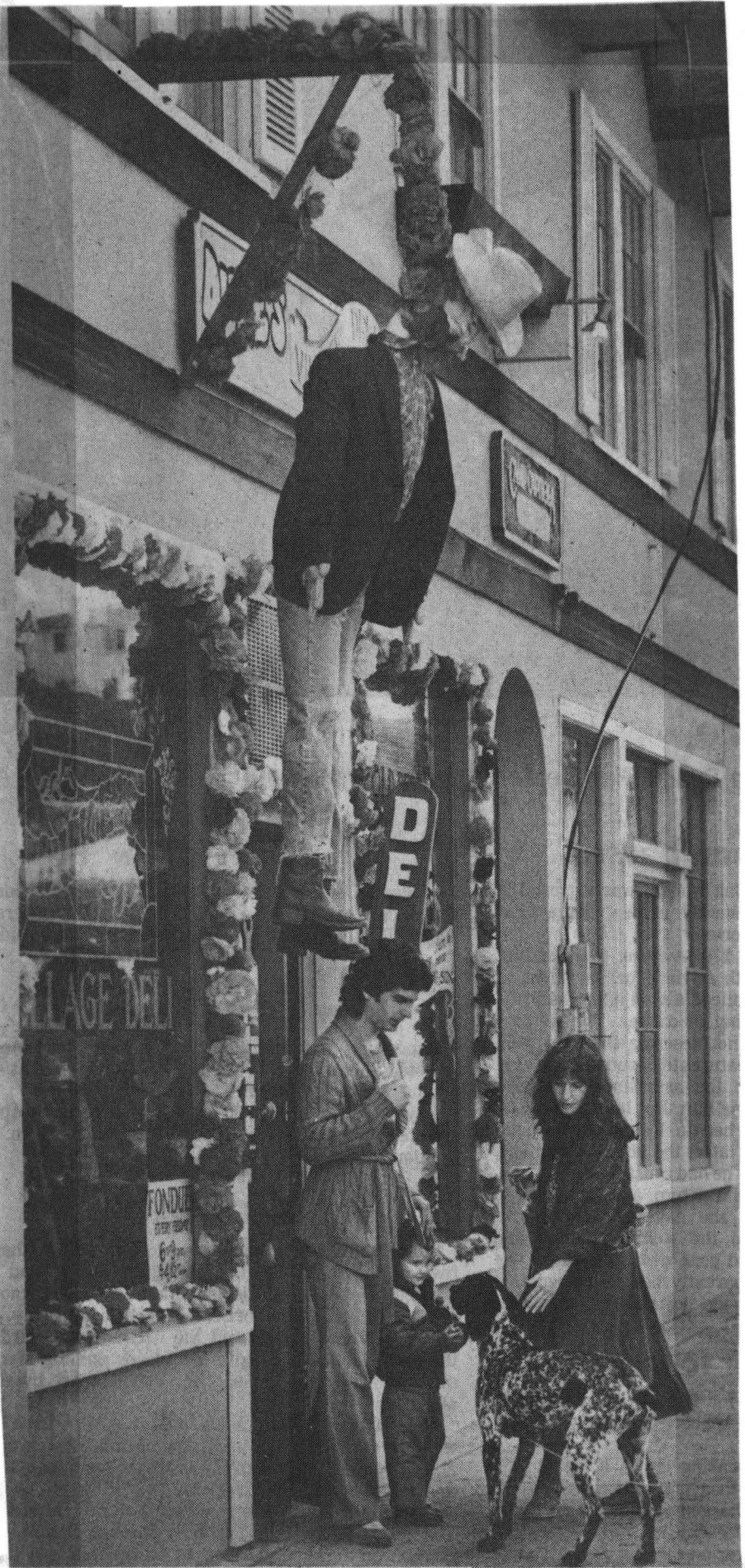
The Hanging Tree won a second place ribbon.